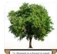
Planted as a forest in need